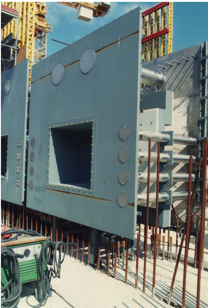
Frames of Radiation Shielding Window on Site