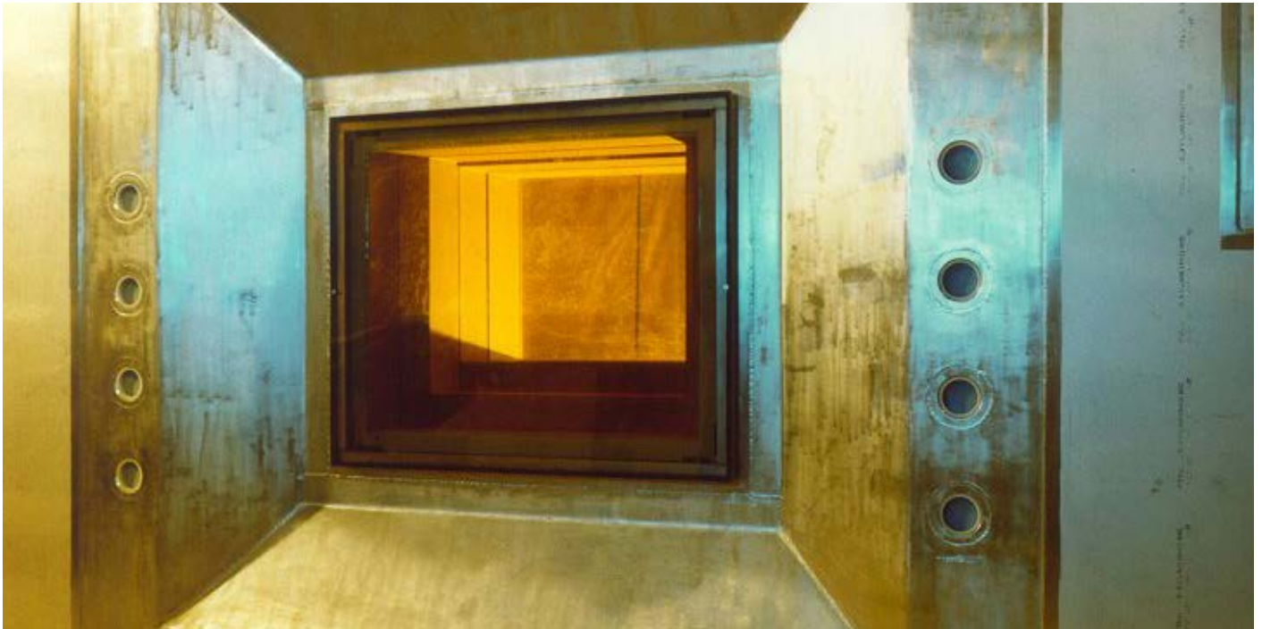
Radiation Shielding Window in Hot Cell Wall