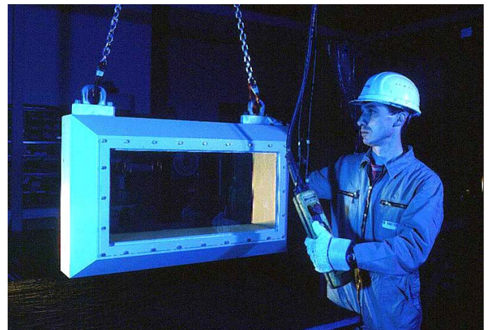
Radiation Shielding Window