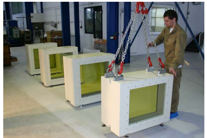
Radiation Shielding Window in Workshop